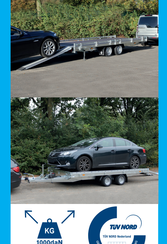
All HAPERT trailers have been provided with the TÜV certified load-securing system!